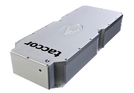
Figure 3: The Laser Quantum taccor with 1GHz repetition rate, to facilitate the ASOPS principle.

The key feature of the ASOPS approach is speed, enabling applications that are impossible with mechanical delay generators. A typical system scans 1ns long TDS traces at sub-100fs resolution in an acquisition time as short as 100µs. By comparison, a translation stage would have to move 15cm distance at an average speed of