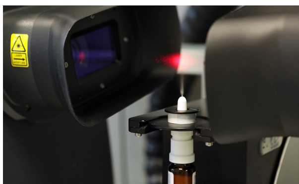
Photograph showing a system employing particle measuring