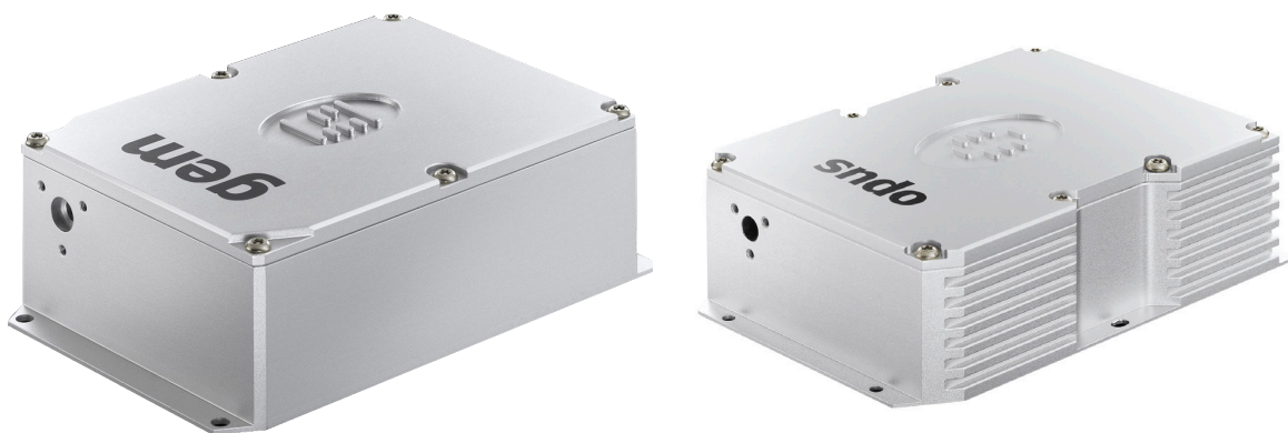
The gem and opus lasers from Laser Quantum

Advanced integrated power feedback is a defining feature of all Laser Quantum products. With this feature, the laser is able to intelligently maintain and optimize its own power levels in order to maintain beam specification with no power fluctuations, making them truly the laser of choice for high reliability, 24/7 system integrated applications.